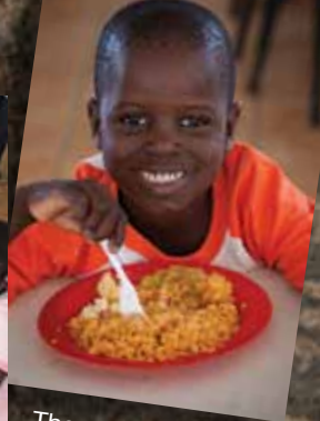
The gratefulness for the food is obvious in the children's smiles.