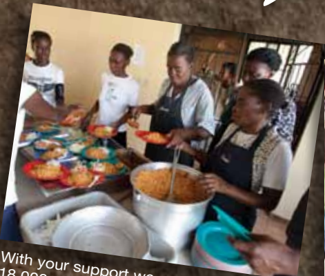
With your support we are able to feed 18,000 meals each month through our feeding program.